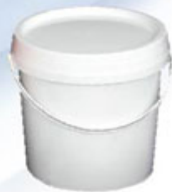
5lt Bucket Product Code: SPF05BCL