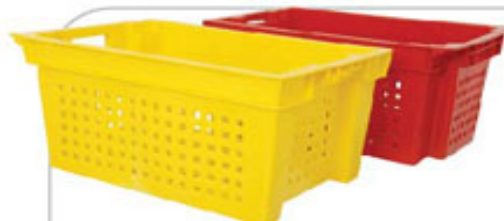
Harvest, Fruit and Vegetable Crate Product Code - Heavy duty - SPFVCTHD Dimensions: 600x400x280mm