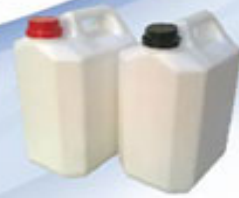
5lt Jerry Can Product Code: SPF05CSM