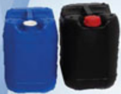
20lt Jerry Can Product Code: SPF20CET