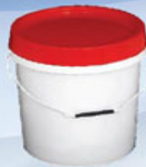
4lt Bucket Product Code: SPF04BCL