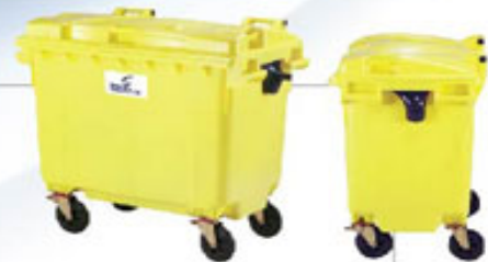
Trash Bins 660LT Product Code: SPWB660