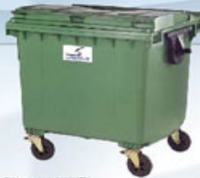
Trash Bins 1100LT Product Code: SPWB1100