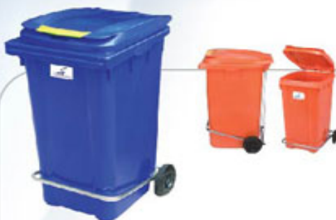
Trash Bins 240LT with foot pedal Product Code: SPWB240FP