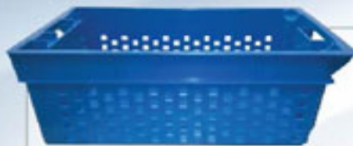
Harvest Fruit and Vegetable Crate Product Code - SPFVCT Dimensions: 580x380x210mm