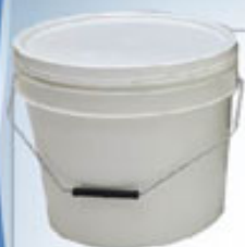
15lt Bucket Product Code: SPF15BCL