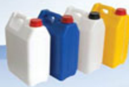
5lt Jerry Can Product Code: SPF05CCT