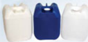
20lt Jerry Can Product Code: SPF20CIN