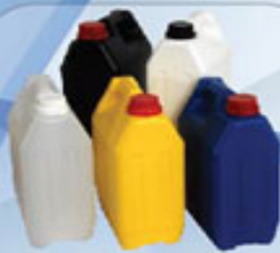
4lt Jerry Can Product Code: SPF04CCT