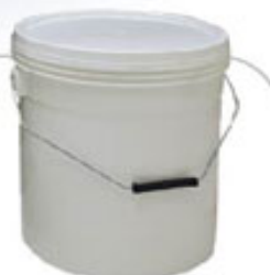
20lt Bucket Product Code: SPF20BCL