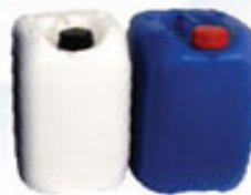
20lt Jerry Can Product Code: SPF20CMS