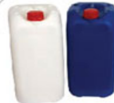
25lt Jerry Can Product Code: SPF25CMS