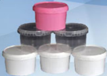
500ml Container Product Code: SPFC500