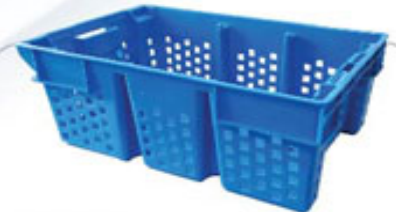
Dates Crate Product Code: New Model - SPFHCT Dimensions: 580x380x220mm