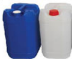
25lt Jerry Can Product Code: SPF25CET