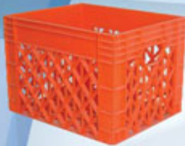
Dairy Crate Product Code - SPFDCT Dimensions: 400x320x310mm