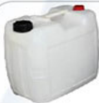
20lt Jerry Can Product Code: SPFCBC