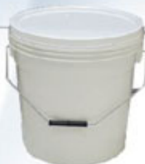
18lt Bucket Product Code: SPF18BCL