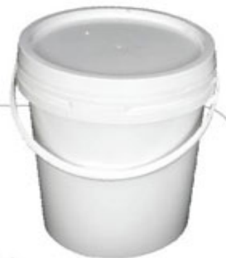
20lt HD Bucket Product Code: SPF20HDP