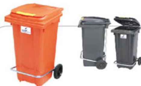
Trash Bins 120LT with foot pedal Product Code: SPWB120FP