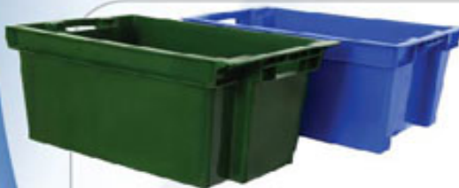
Fish & Multipurpose Crate Product Code - SPFFCT Dimensions: 600x400x280mm